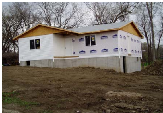
Home now under construction at 2516 Rose Lane

In 2006, the first year of the alliance, 313 families in 43 states achieved the dream of home ownership - a projected six percent increase in Habitat’s U. S. home production.