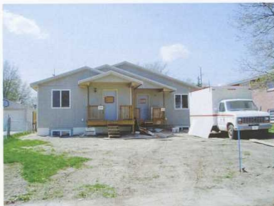
2506 Jackson Street Habitat Duplex

The volunteers have been working hard throughout the winter on this duplex located in Olde Towne and their efforts are paying off! The project is nearing completion! We look forward to dedicating this home this summer.