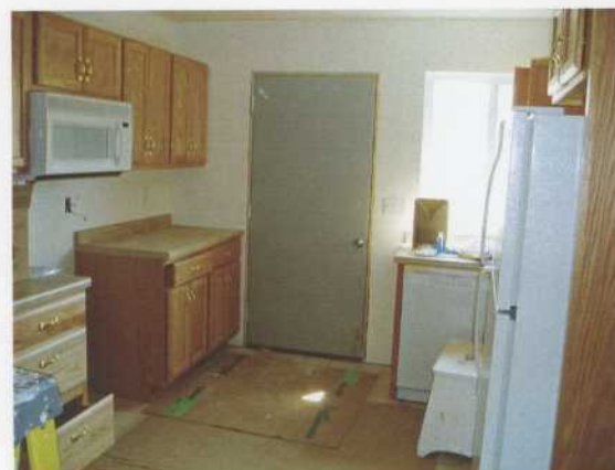
Kitchen in the South Unit